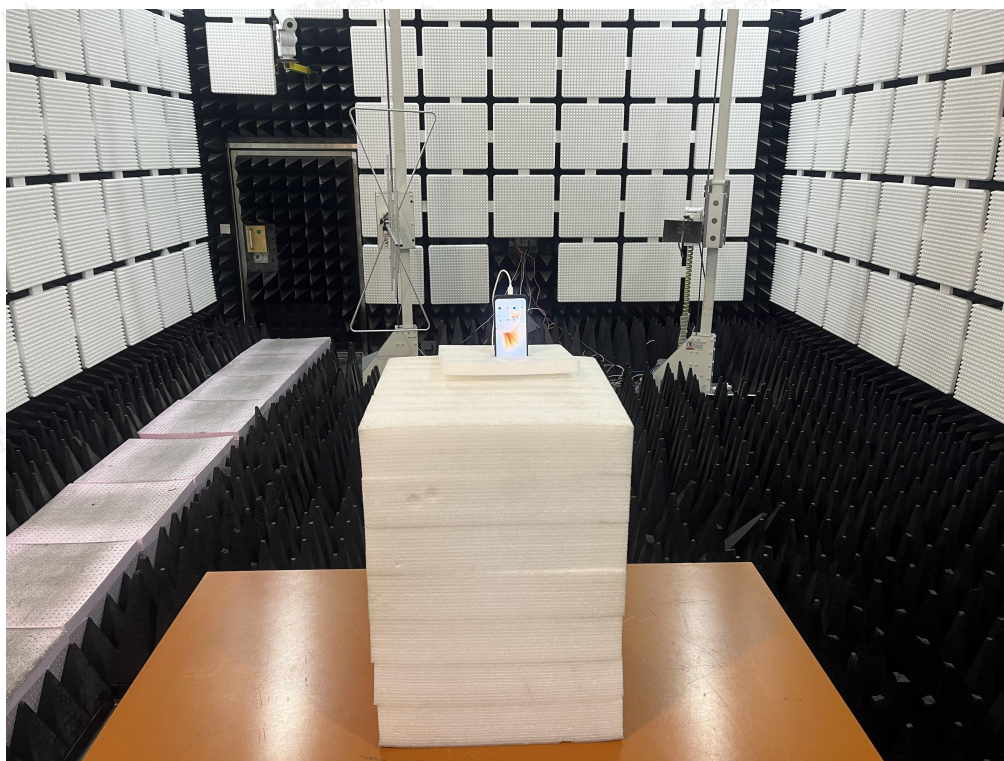
Spurious Emission below 1GHz & above 1GHz